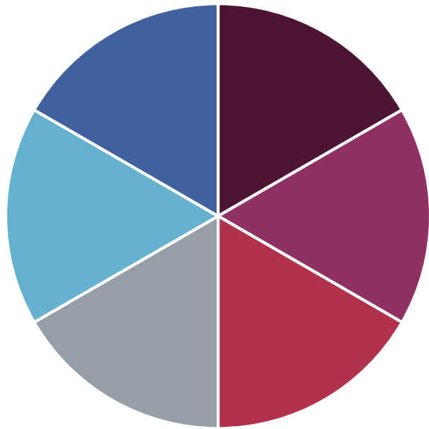
W/Testing and Interview