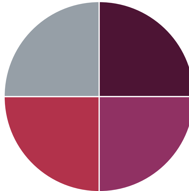
Without Testing and Interview