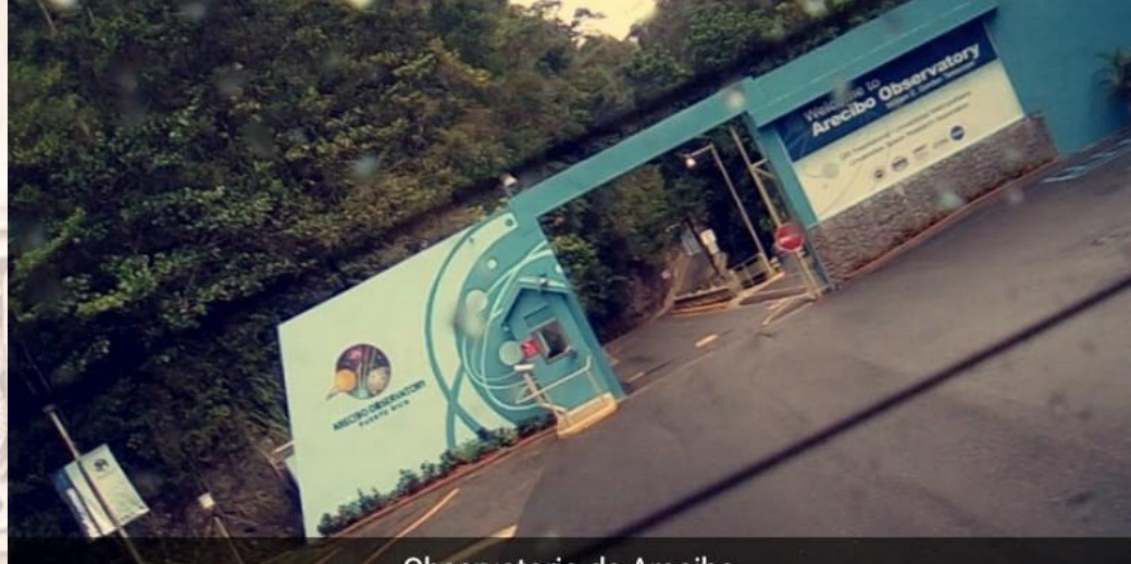
Observatorio de Arcibo

Our biggest hope is that Spanish will enrich your life.